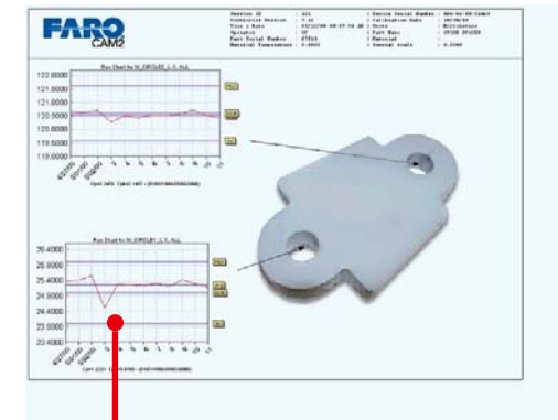
SPC Graphical reports show process trends